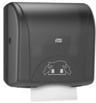
401012 – H86