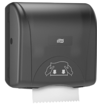
408203 – H76