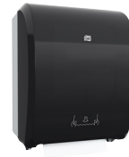
400877 – H71