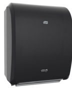
401172 – H71