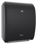
403336 – H80